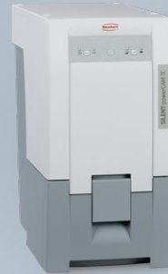
SILENT powerCAM TC Extraction unit for CAM systems Art. No. 2938 0000