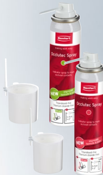
Occlutec Occlusion spray green, 75 ml Art. No. 1935 2000 red, 75 ml Art. No. 1935 3000