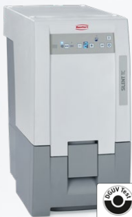
SILENT TC Single workbench extraction Art. No. 2935 0000