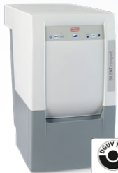
SILENT compact Single workbench extraction Art. No. 2934 0000