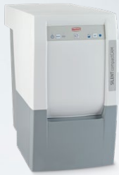
SILENT compactCAM Extraction unit for CAM systems Art. No. 2934 2000