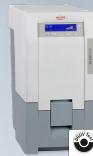
SILENT EC2 Two workbench extraction Art. No. 2937 0000