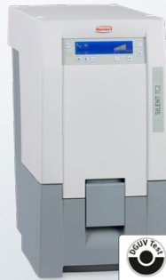
SILENT TC2 Two workbench extraction Art. No. 2936 0000