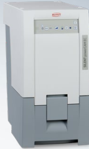
SILENT powerCAM EC Extraction unit for CAM systems Art. No. 2939 0000