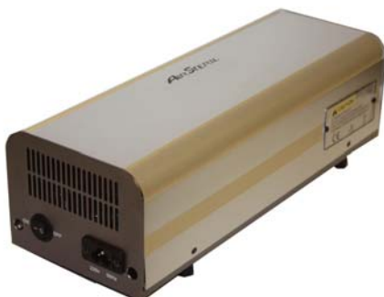
Air Steril MP 20 Test Unit

The HPA results on both air and surface contaminants clearly show the value of this technology as part of the infection control process in any medical environment. In addition to the extensive laboratory testing and validations the Air Steril units have been successfully installed, studied and tested in a variety of real world environments (customer reports and testimonials are available on request).