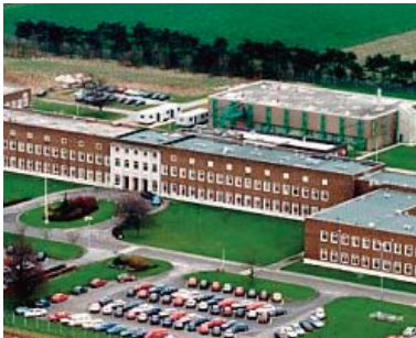
Porton Down Labs

Air Steril units will kill harmful airborne and surface viruses including Rhinovirus (Common Cold), Norovirus (Gastroenteritis) and Influenza. Even antibiotic resistant surface pathogens such as MRSA or C difficile are killed in all indoor areas.